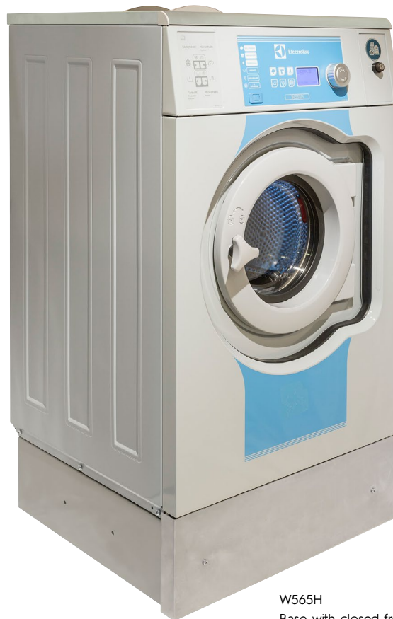
W565H Base with closed front and sides